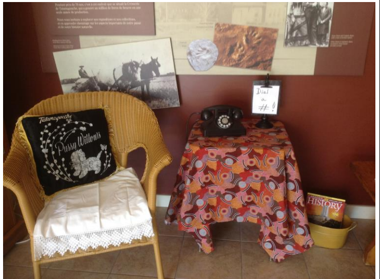
Do you remember why we "dial" a number?