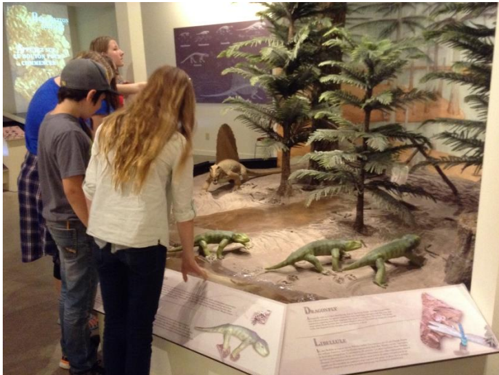
Local students viewed the Brule fossils in June.

We truly appreciate the generous financial support of Friends of the Heritage Centre and the irreplaceable gift of time from our volunteers. "Three cheers" and "Thank you!!!" to our Friends, donors, and volunteers. We depend on you for our continued success.